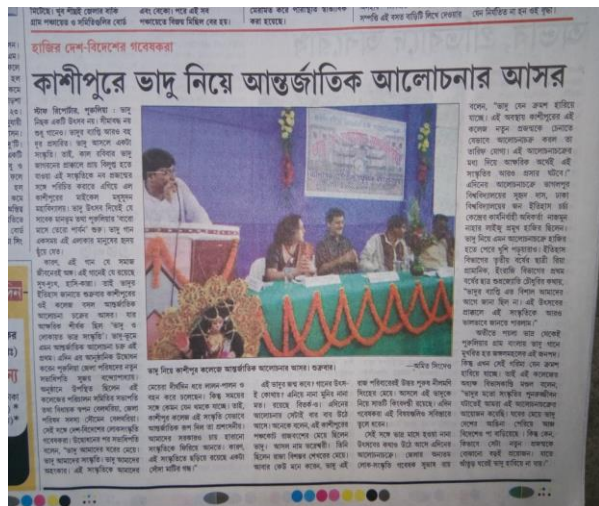
(Report of the Seminar in Local Paper)