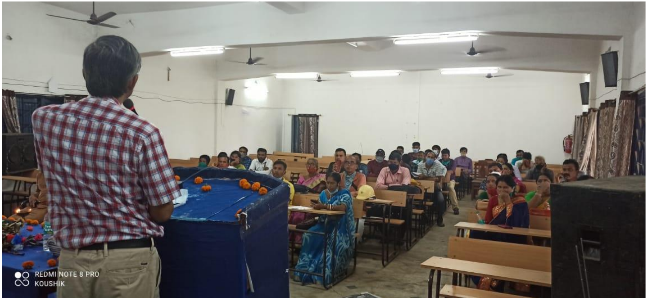
(Convocation of the Diploma Course on Bhadu)