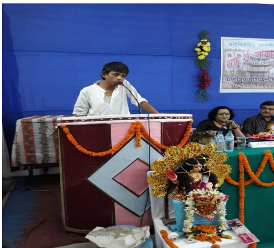
(Special Lecture of the Seminar)