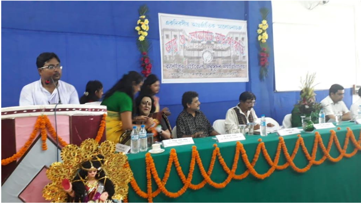
(International Seminar on “Bhadu and Bhadra Culture”)