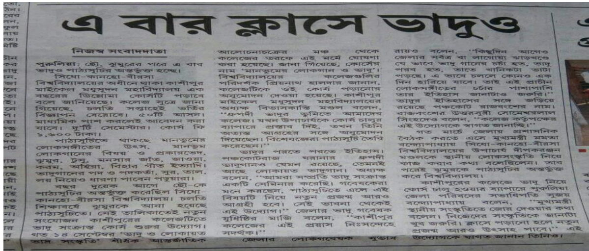
(Class Report on News Paper)